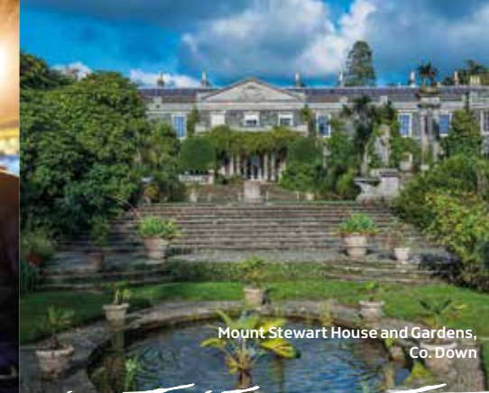
Mount Stewart House and Gardens, Co. Down