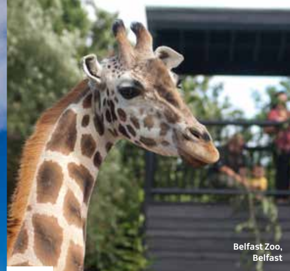
Belfast Zoo, Belfast