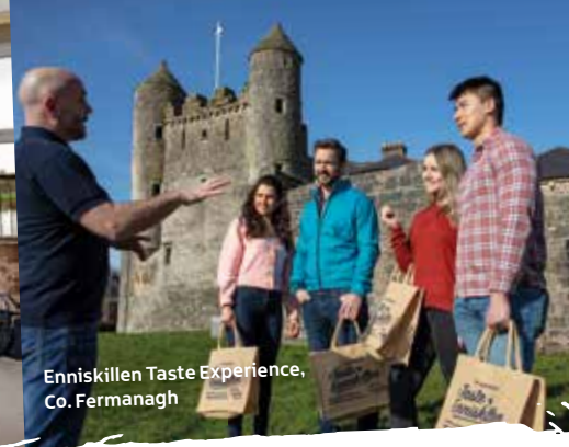
Enniskillen Taste Experience, Co. Fermanagh