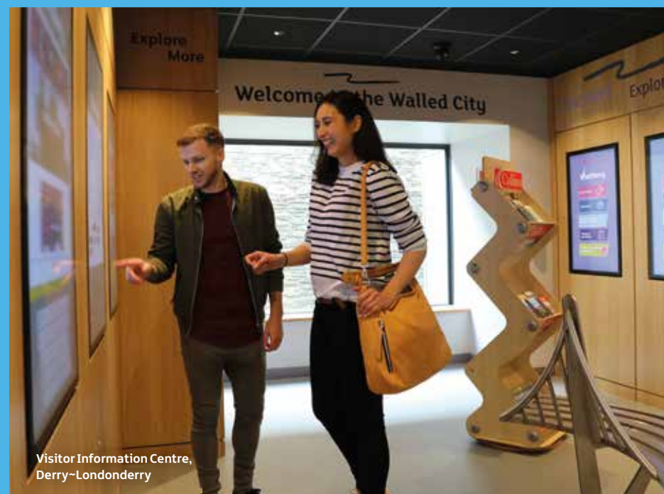
Visitor Information Centre, Derry~Londonderry

There's lots of things to see and do in Northern Ireland; so much so it's hard to describe them all in the one place. That's why we direct visitors to our Visitor Information Centres dotted around the region. You'll meet friendly staff who love every inch of the place and who will be happy to wax lyrical about the hidden gems, must-sees and top tips for exploring their area. For a full list of Visitor Information Centres, check out the Visitor Information section on discovernorthernireland.com/plan-your-trip/visitor-information