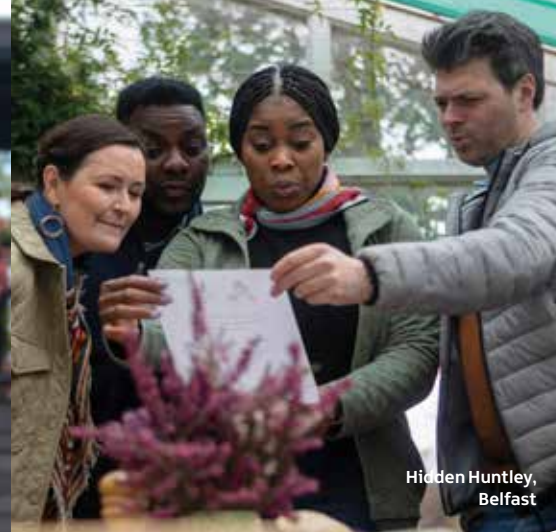
Hidden Huntley, Belfast