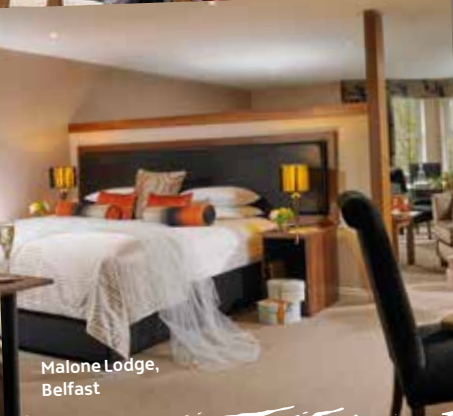
Malone Lodge, Belfast