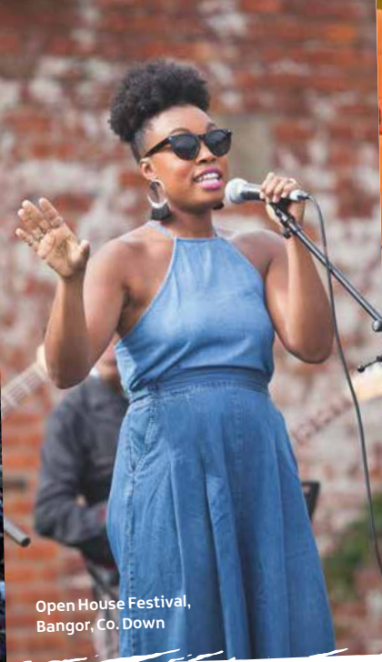
Open House Festival, Bangor, Co. Down