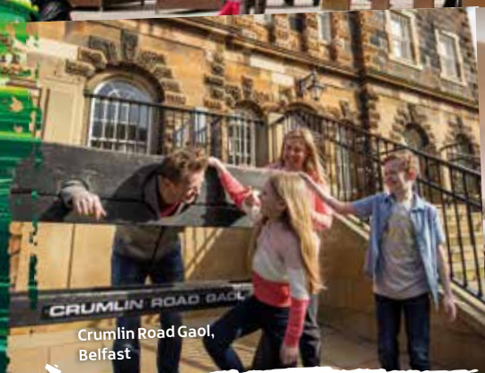
Crumlin Road Gaol, Belfast