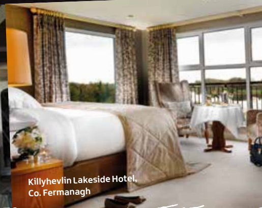
Killyhevlin Lakeside Hotel, Co. Fermanagh