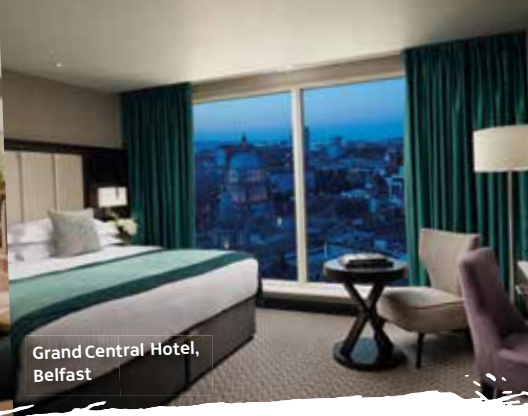
Grand Central Hotel, Belfast