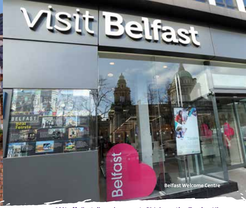
Belfast Welcome Centre

10% off all retail purchases up to 31 July quoting Tourism NI.