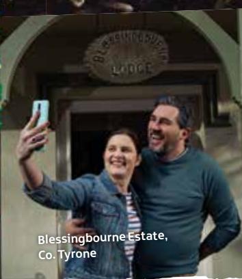
Blessingbourne Estate, Co. Tyrone