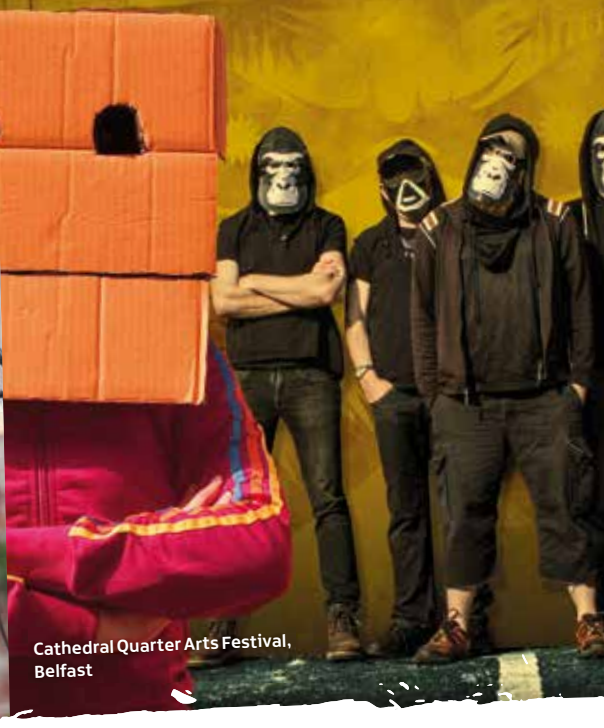
Cathedral Quarter Arts Festival, Belfast