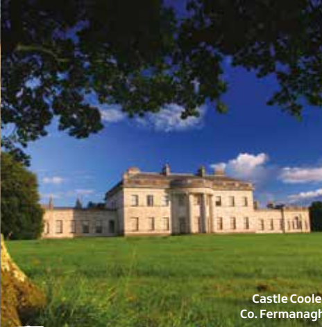
Castle Coole, Co. Fermanagh

Killyhevlin Lakeside Hotel (4*) is set on the shores of the idyllic Lough Erne. Residents can enjoy full use of the health club, with its indoor swimming pool and outdoor hot tub. Or, if you want to wind down, there's the heavenly Kalm Spa. If you prefer your own space, their secluded self-catering cottages will have you in a world of your own.