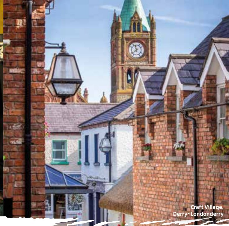
Craft Village, Derry~Londonderry