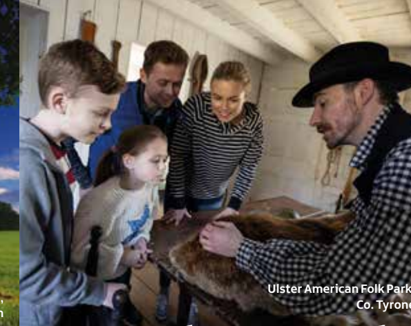
Ulster American Folk Park, Co. Tyrone