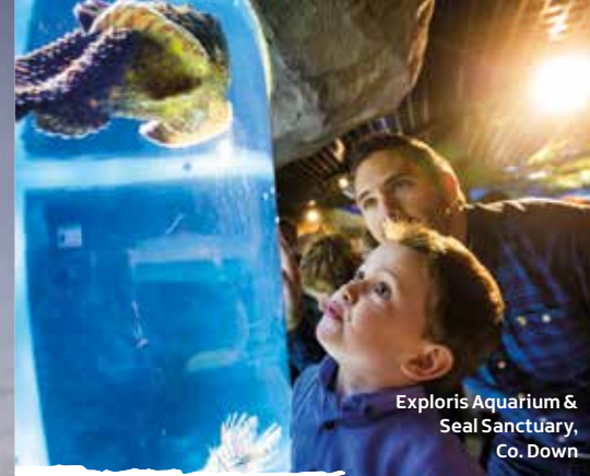
Exploris Aquarium & Seal Sanctuary, Co. Down