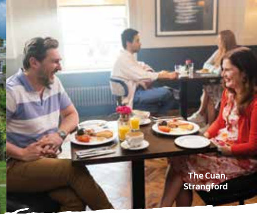
The Cuan, Strangford