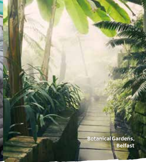
Botanical Gardens, Belfast